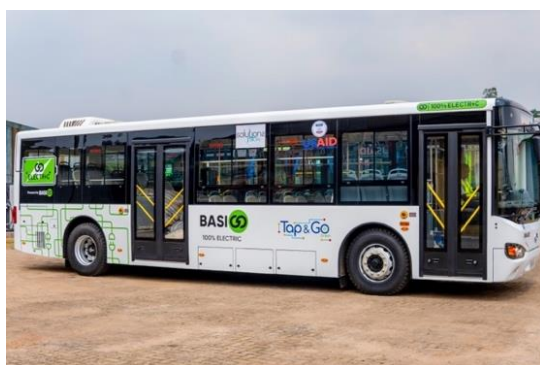
Figure 4: Electric buses piloted in Kigali

Results from the project informed the development strategy and financing model for scaling electric buses, resulting in a Kigali E-Bus Master Plan initiated by the City of Kigali and ITDP in the second half of 2023. This study explores factors influencing the operations of electric buses, such as daily range, topography, and demand along each route. It incorporates a model to determine the routes which can go electric in the short and long terms, the energy required to power the electric buses, and the charging infrastructure technology to be adopted.