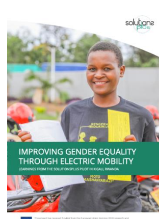
Figure 22. Gender-inclusive e-mobility Checklist