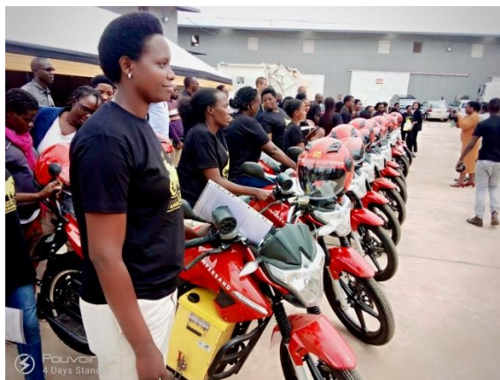
Figure 11. Handing over E-Motorcycles to trained women in Kigali