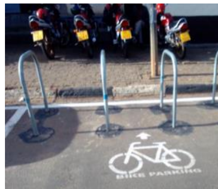
Figure 3. Bikeshare scheme and bike rack deployment in Kigali