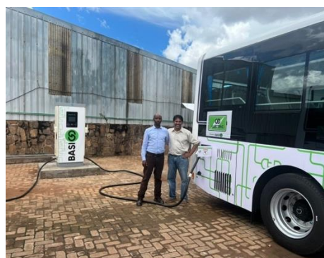
Figure 5: Electric bus charging station