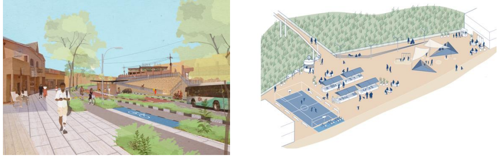
Figure 6: Design recommendations to improve non-motorised transport infrastructure, intermodality and charging infrastructure in Kigali (TUB, University of Rwanda)

Awareness raising Partners of the SOLUTIONSplus Kigali Living Lab were informed through numerous tools and guides on the various forms of electric mobility supported in Kigali. Knowledge products on vehicle technologies, charging strategies, and relevant policies for in East Africa were incorporated into the SOLUTIONSplus online toolbox, (for instance, 'Electrifying motorcycle-taxi fleets - Illustrative examples from East Africa ', 'Electric Vehicle Charging Infrastructure - Kigali Demonstration Action', 'Electric Bicycles in Rwanda: Fiscal and Regulatory Framework,' and 'Improving Gender Equality Through Electric Mobility: Learnings from the SOLUTIONSplus pilot in Kigali, Rwanda.').