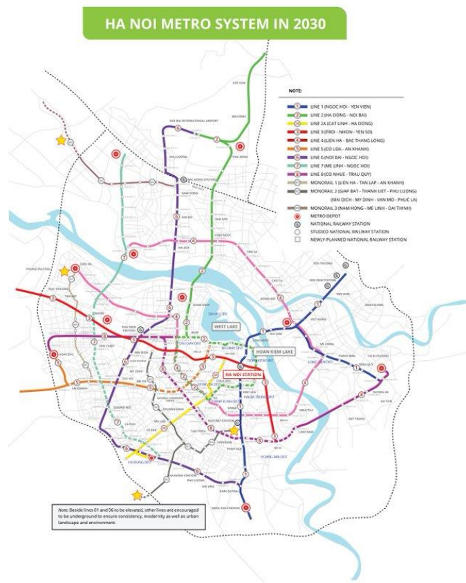
Figure 1: Hanoi metro system in 2030