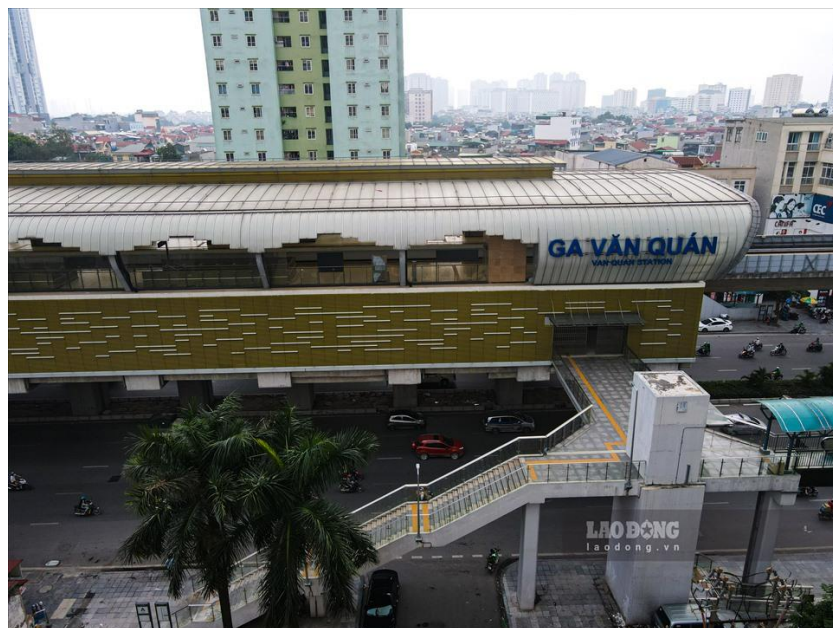
Figure 2: Van Quan metro station